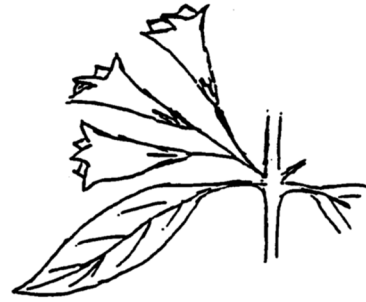
2 simple panicle