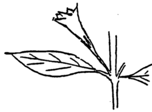
1 solitary flower

Ad. CPVO 14 / UPOV 15: Inflorescence: type