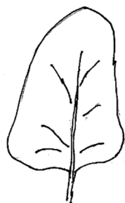
1 absent or very weak