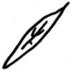
1 absent or very weak