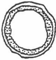
1 absent or thin