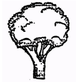
2 transverse broad elliptic