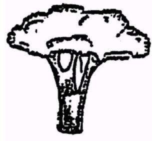
4 transverse narrow elliptic