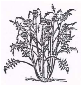
2 more than one