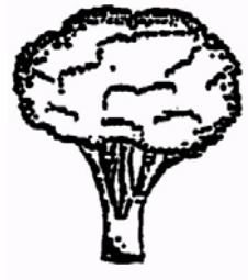
3 transverse medium elliptic