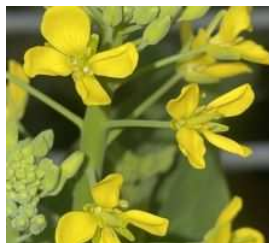
male sterile (pollen absent)