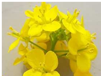
male fertile (pollen present)

Observations should be made on fully opened flowers. Tapping or shaking the flowering stem will release pollen, which, if present, can be observed on dark coloured paper or card. The absence of pollen production is an indication of male sterility. The presence of pollen production is an indication of male fertility.