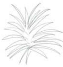
2 upwards and outwards