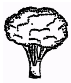
3 transverse medium elliptic